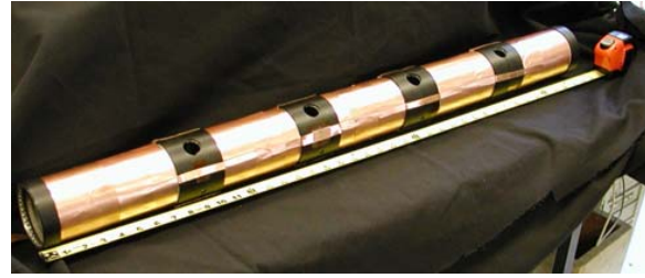
Figure 1: The one-meter-long \text{BaTiO}_3 FEPS consists of five individual sources with diagnostic ports between the sources.

Simply connecting the five sources in parallel to a single pulse-forming network power supply yielded non-uniform source performance due to the time-dependent nature of the load that each of the five plasma sources experienced. Furthermore, the first two sources fabricated were extensively tested compared to the remaining three.